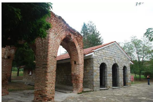
Kazanlak Thracian Tomb

Departure for Kazanlak known also as The Valley of the Kings or The Rose Valley. Visit to the Kazanlak Thracian Tomb; Burial mounds (Golyama Kosmatka, Ostrusha, Shushmanets, Helvetsia and Griffoni); Historical Museum in Kazanlak. If possible, depending on the time, visit to the Rose Museum. Time for lunch and departure to the open Ethnographic Complex Etara, which was opened in 1964 in Gabrovo. Departure for Veliko Tarnovo. Accommodation in a hotel, free time and overnight.