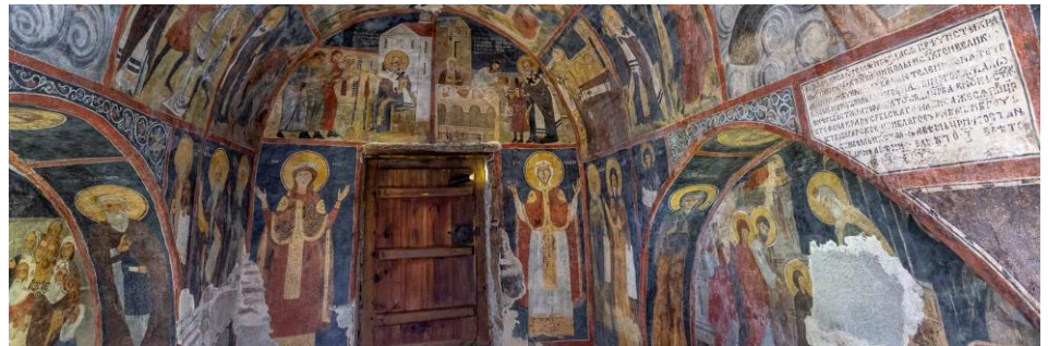
Boyana Church /outside and inside/